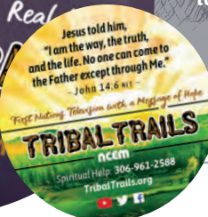
flip side of coaster

Help spread the message of hope by sharing this unique gift. Contact us to receive all the coasters you want!