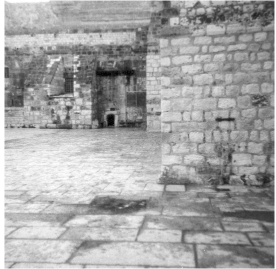
Entrance to the Church of Nativity

Jesus grew up like other children, Luke 2:40,52. Jesus obeyed His parents, Luke 2:51-52.